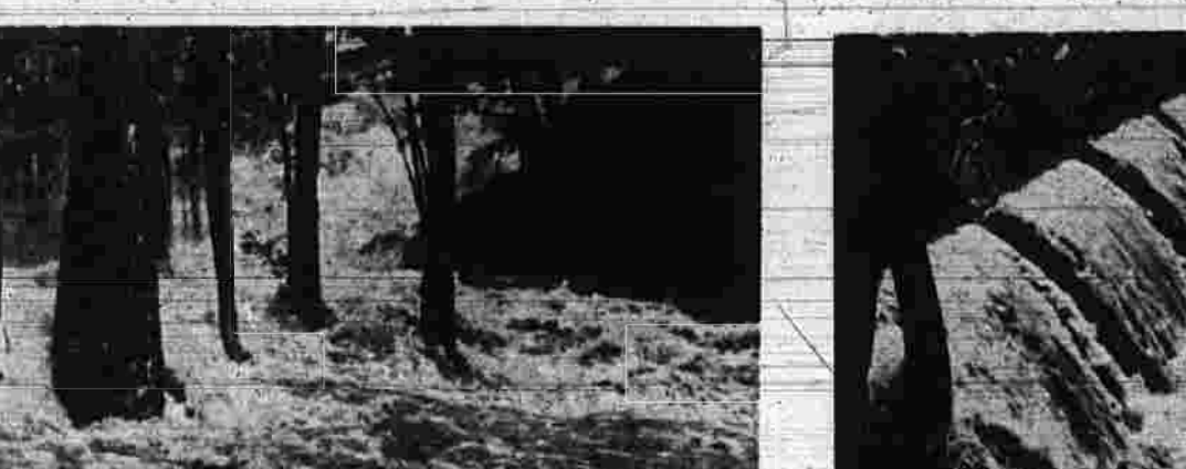
Right foot opening in Salter's Pond dam (above) through which water leaked to demolish the abutments and adjacent roadway.