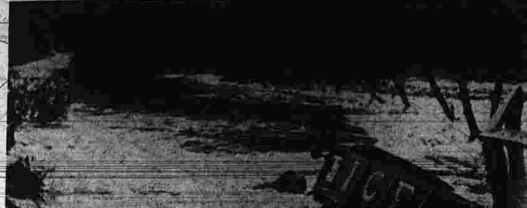
Scene at Oakland street (above) as the water from Salter's Pond, released by the breaking of the earth dam, tore away a large section of the highway north of the bridge.