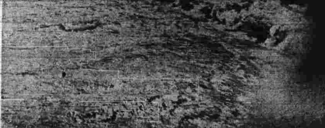
View of the torrent of water pouring down through the Highland Park Community House from the falls. The iron pipe from which water leaked to demolish the abutments and adjacent roadway.