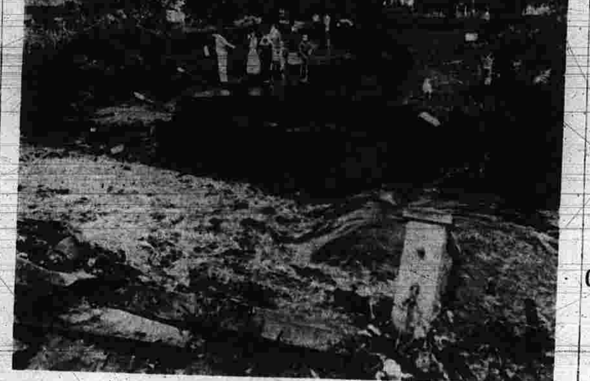
When a ten foot wall of water, loosened by the collapse of the concrete highway bridge on Parker street near the William Fields Paper Company plant, struck the concrete highway, heavy slabs of concrete were toppled over and carried 25 to 50 feet above the river. Photograph above shows the damage in the Parker-village-or-north side of the river. At left of picture the waters rushed into the basin formed when the paper mill dam also gave way.