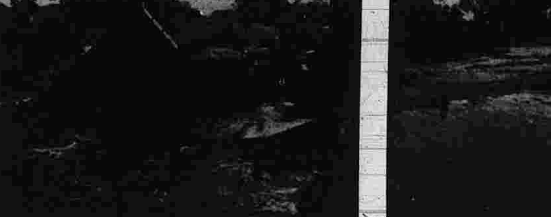
Debris of the Parker street bridge (above) after the wall of water from Salter's Pond demolished the abutments and adjacent roadway.